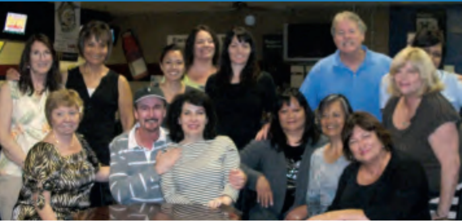
Royal Aloha resort managers meet with members of the Corporate staff in Honolulu. After a week of sharing common concerns, challenges and solutions, the managers returned to their respective resorts with renewed enthusiasm.